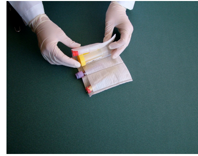
Place large tubes on top of pouch.