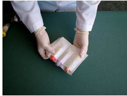
The pouch can hold up to 4 tubes.