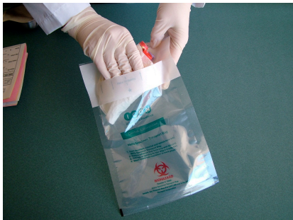
Place 1 pouch into 95kPa bio bag.