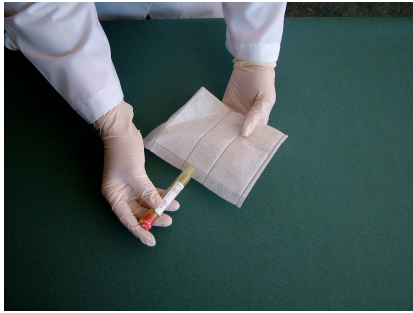
Insert tubes into absorbent pouch.