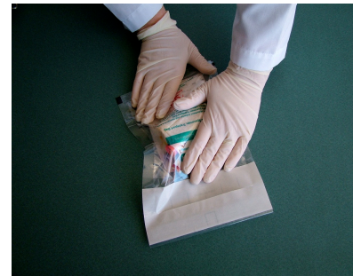
Press bag to remove air.