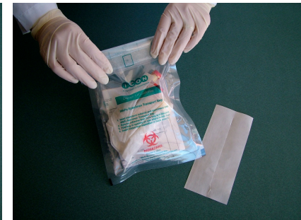
Remove adhesive strip and seal bag.

Note: When specimens are to be shipped on dry ice, do not place requisition in 95kPa bag. Place requisitions on top of inner foam box in shipper